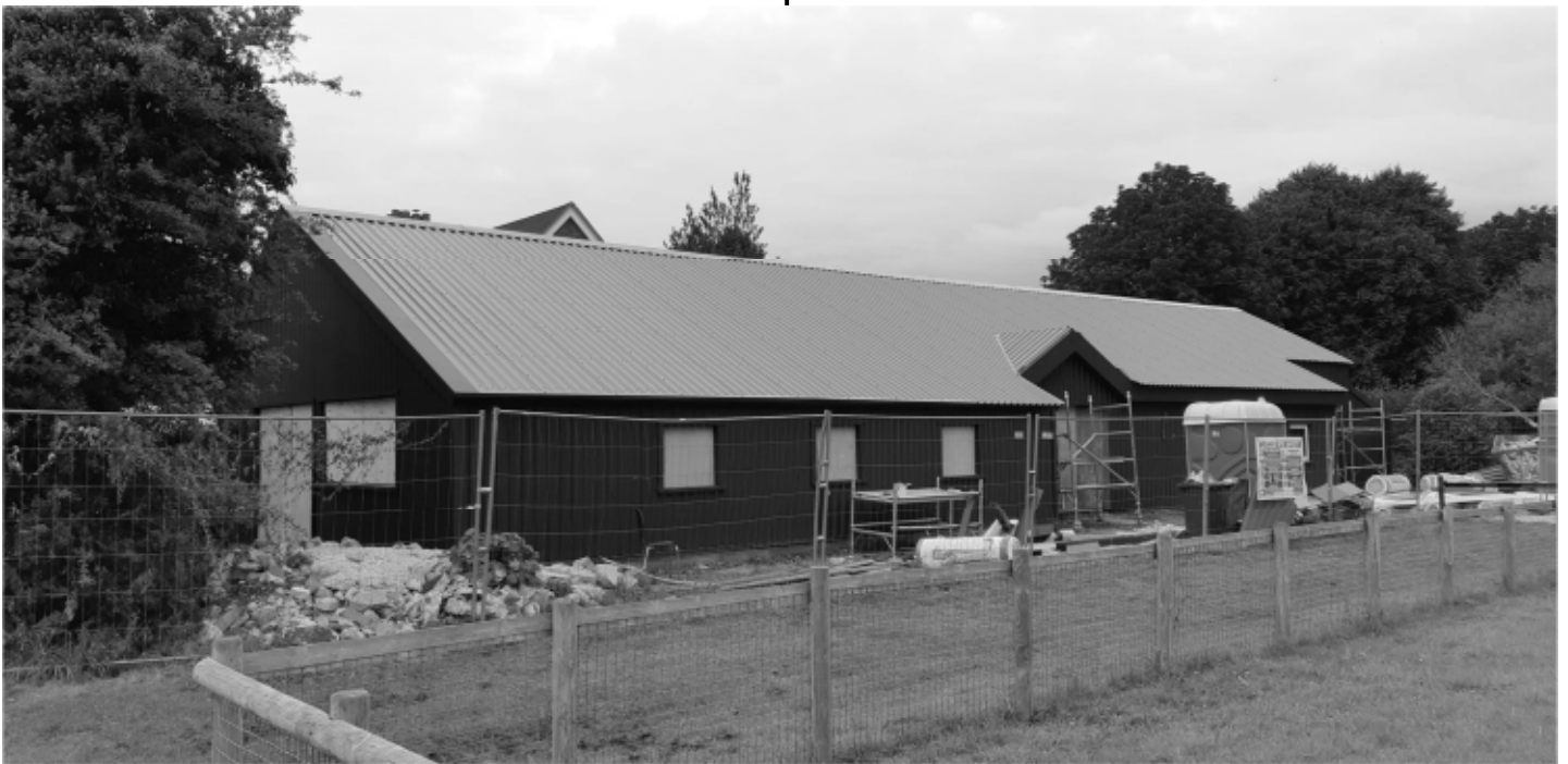
The Victory Room at the end of September 2021