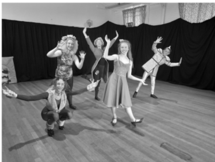
Dorothy, Toto & friends during filming of the school's biannual musical The Wiz

Of course, it wasn't possible to invite an inside audience, so after two years of work, the wonderful Wiz full length epic film was finally launched and Claire held two 'premiere' viewings for the cast in the Oak Room with full press coverage, interviews of the stars, popcorn and much laughter.