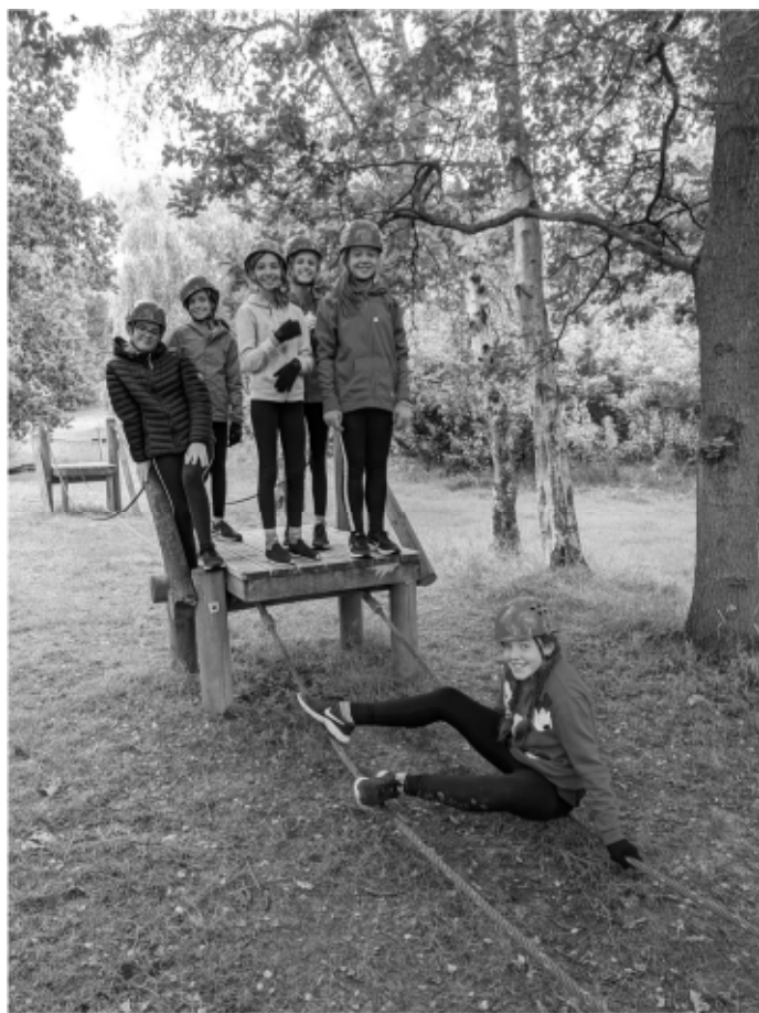
Bucklebury Guides on the Low Ropes at Thirtover Place on one of the summer activity days.

It seemed to rain a lot of Monday evenings before the summer holidays so we met at Beenham Victory Hall where we started our conscious consumer badge and learnt about Fairtrade. We also made instant ice cream (which failed!) and learnt how to tie knots and make bedding rolls. We finished the term with a family picnic on the Recreation ground and a big game of rounders. We said