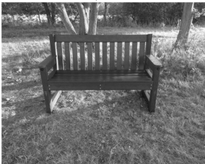
One of the new benches in the Hockett Field.