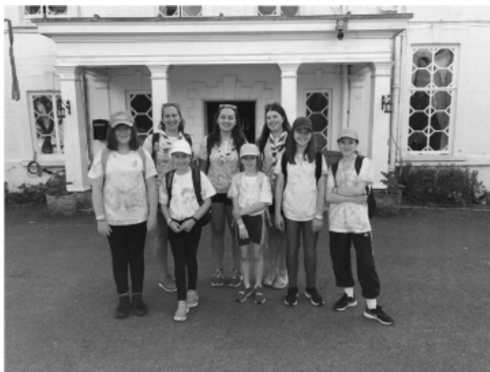
Bucklebury Guides at Fearless Fun, Foxlease

To start the Autumn term, we completed our Rambler's