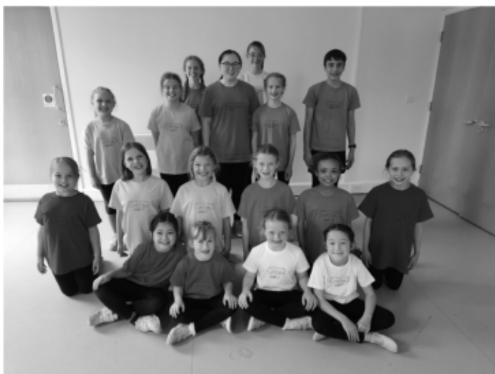
Participants in Joseph Summer School this August