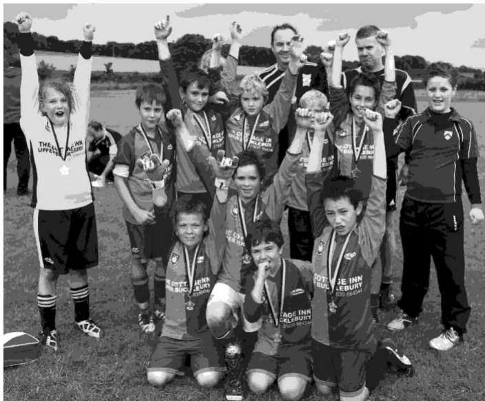
Bucklebury FC "Gray's" Team win the "World Cup" 2012

The Club is planning to continue playing until December,