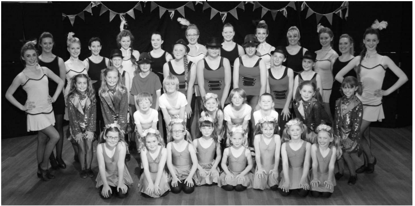
The Cast of Summer Sizzlers 2012