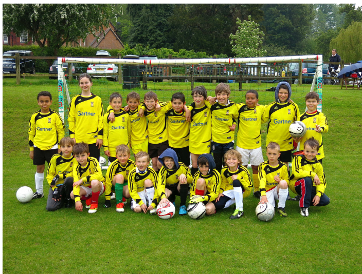
Bucklebury Wolves- Senior Cup World Champions 2013

Bucklebury Wolves held their 4th annual World Cup tournament in September, 102 players represented 15 teams and contributed to a fantastic morning of football played in great spirit despite the drizzle. Junior and Senior Cups were awarded and medals issued to each player.