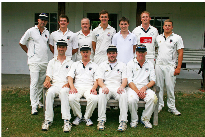
Bucklebury Cricket Club

After feedback last year, we tried to mix it up a bit this season, so enabling more people to bat and bowl. I think that we succeeded in that, and I hope that people enjoyed the games more as a result (even if we lost a few more matches).