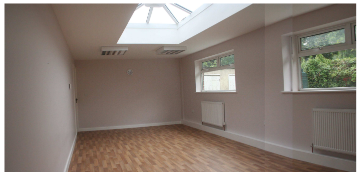
The refurbished Committee Room

We have built a new store room so all storage has been removed from the committee room. Meanwhile the committee room has been completely refurbished and looks stunning. A huge skylight has been put in the roof, the