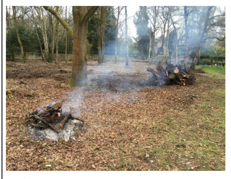
Bonfire in the Cemetery.