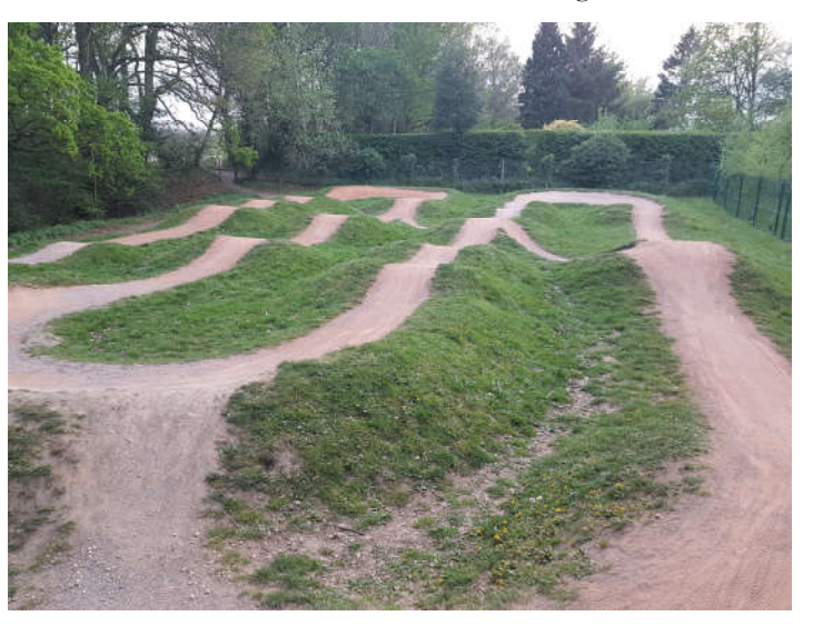
The resurfaced bike track.

The track is very well used by a wide variety of ages and abilities and it is wonderful to see our youngest children learning to use the track on scooters and trikes in the mornings and early afternoons then the teenagers showing their skills in the later afternoons and evenings.