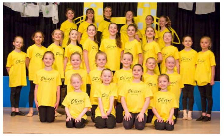
Cast of "Oliver" - 12th April 2019