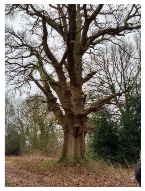
Veteran Tree in Hopgoods Green