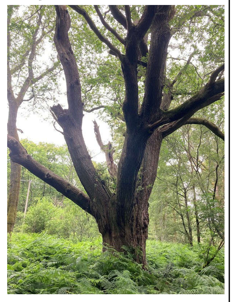
A veteran oak tree on the Common

The owner and custodians of the Common are keen to make it as good for wildlife as possible, a great place to visit, and preserve the local heritage. Despite the valiant efforts of local volunteers, some areas have changed dramatically over recent decades – some heathland is covered in birch scrub, ponds are full of silt and overshaded, and the woodlands lack diversity – all causing a loss of wildlife.