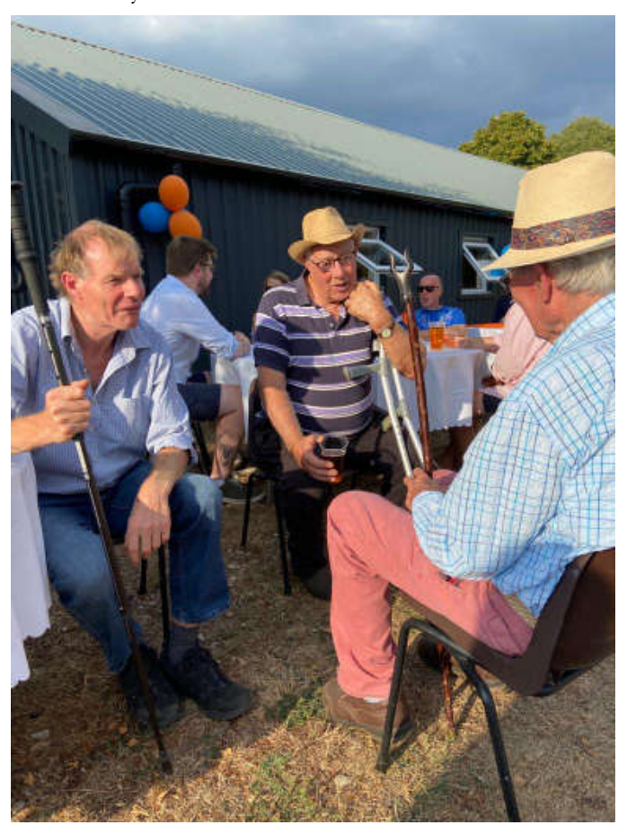
Bucklebury's three wise men.

We had our first Beerfest since 2019 on 27<sup>th</sup> August. We were able to hold the event earlier this year as there was no Chapel Row Fayre, more of that later. We had a very successful afternoon that included selling all but one polypin of beer, more than 1000 pints and over 200 pints of cider. We offered beer from a new brewery this year, Amwell Springs in Cholsey in addition to four others including WBB, Indigenous, Bond and Ramsbury.