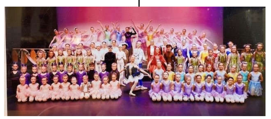
The cast of The Sleeping Beauty.

<u>cbowden1602@gmail.com</u> <u>wbbslucie@gmail.com</u>