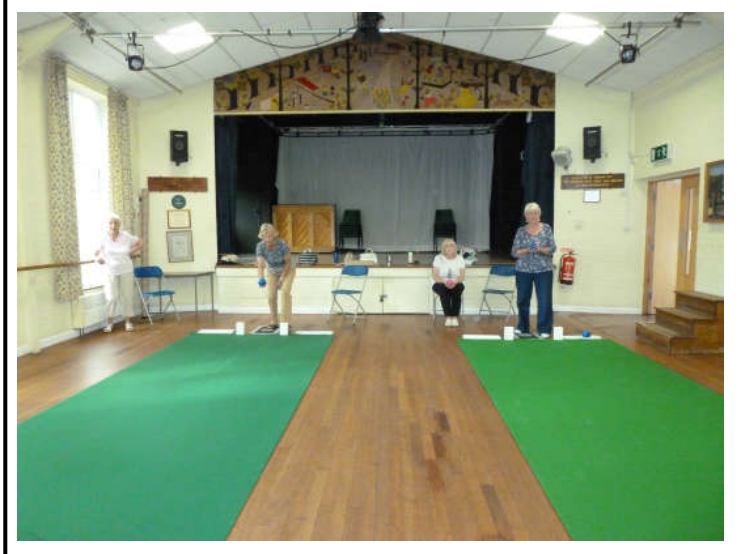
Carpet bowls in the Memorial Hall.

We have just had an uninterrupted eight months of bowling since the beginning of the year, and have manged a happy two hours bowling every Monday morning and Friday afternoon.