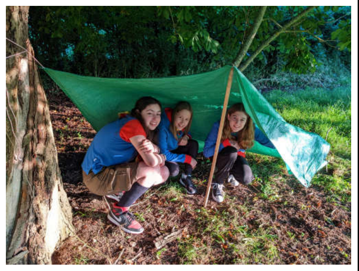
Guides in one of their shelters.

1st Bucklebury Guides have had a busy summer term. We started the term working towards our survival badge. The Guides learnt how to read, give and follow directions using a map and compass, what to pack in a backpack when going out for a walk, how to signal using mirrors and how to build a