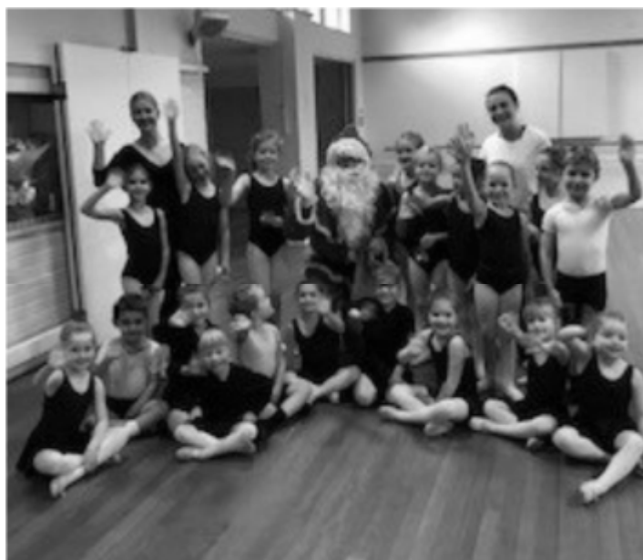
Father Christmas popped in to watch some ballet.

Early Christmas present for our dancers who took their ballet exams at the end of last term – we heard that, once again, we had a 100% pass rate with 50% being awarded Distinction (more than 80%) and the others gained a Merit with marks of over 60% - congratulations – all that hard work was worth it!