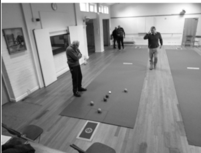
Bowls in the Memorial Hall.