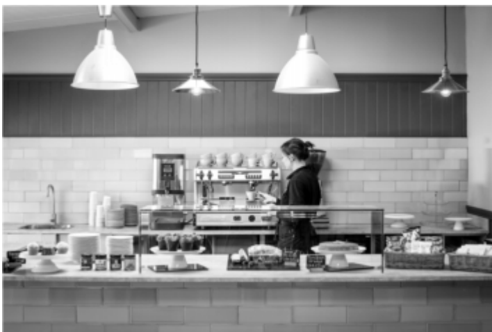
The Counter at Honesty Bucklebury

champion this undervalued and underappreciated product. Her vision was to return bread making to its four basic ingredients – flour, water, yeast and salt. No enzymes, no emulsifiers, no trans fats and no preservatives – just natural, wholesome, honest ingredients. Thus Honesty business was born and has continued to expand its reach remaining true to the values that inspired its inception.