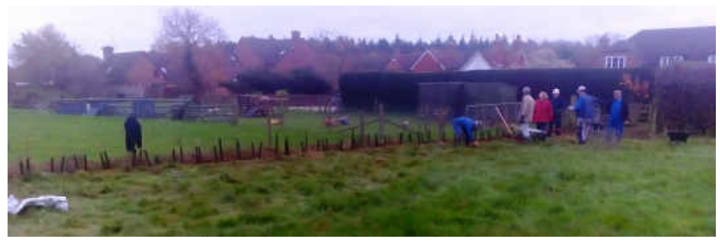
West Berkshire Countryside Society working on the meadows.