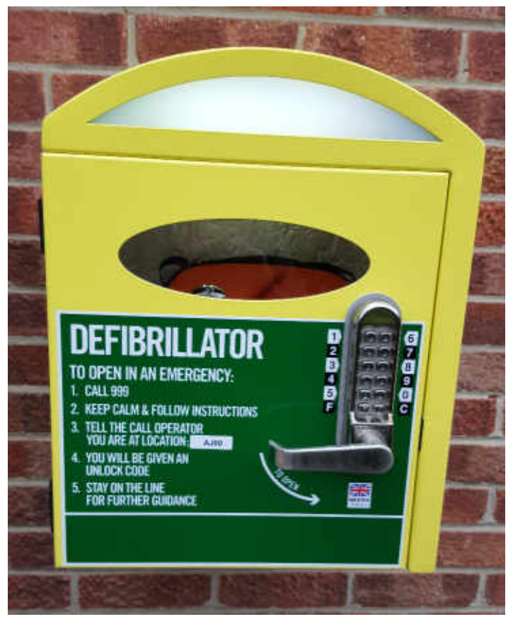
Peach's Store de brillator

Here is the important bit: you do not need any training to use this device! If you find someone who has collapsed and you cannot get a response from them, ring 999 immediately. The call handler will talk you through a few checks, instruct you on starting CPR, and ask for a postcode. They will check their system for the nearest