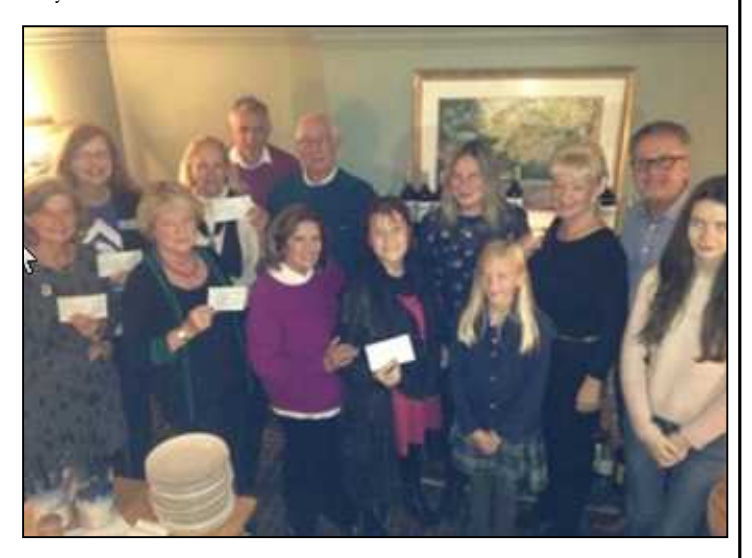
£7,000 handed over to six local Charities in September 2015 will be the twentieth year of Chapel Row Charity Fayre.

£7,000 was handed over to six local charities at the Bladebone Inn in September. The 2014 charities were West Berkshire Mencap, the Motor Neurone Disease Association (MNDA), Alexander Devine Children's Hospice and Macmillan Cancer Care. All received donations of £1,500, with £750 given to Riding for the Disabled and £250 to the Anthony Nolan Trust. The August Fayre was a great success, we had our highest attendance rate, with more than 3,000 people visiting on the day.