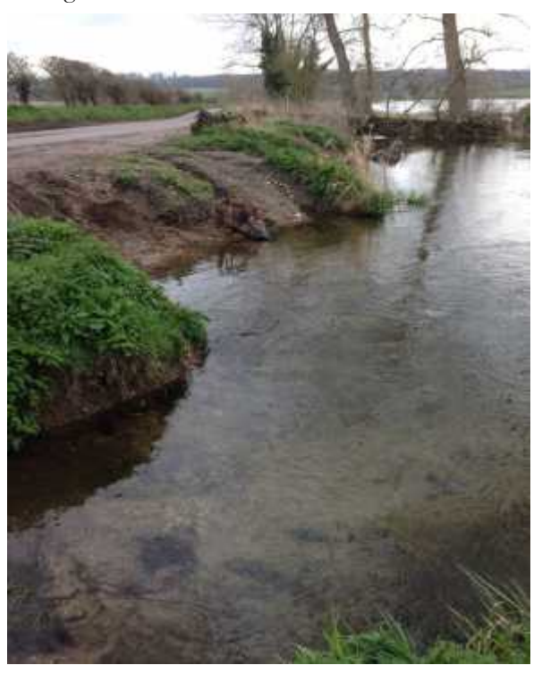
River Pang between the fords at Bucklebury.

Bucklebury ford is a well loved beauty spot on the River Pang. Last year this well known and loved landscape was looking more like a dirt bike track rather than a globally rare chalk stream. The banks and river were being destroyed by drivers and riders of four wheel drives and trail bikes on a fun day out. As well as looking ugly the effect on the river is very damaging and as well as affecting flows the erosion leads to overwidening and siltation. This activity is of particular concern when trout are spawning and any disruption to the gravels on the bed of the river by the wheels of these vehicles is a threat to the next generation of trout.