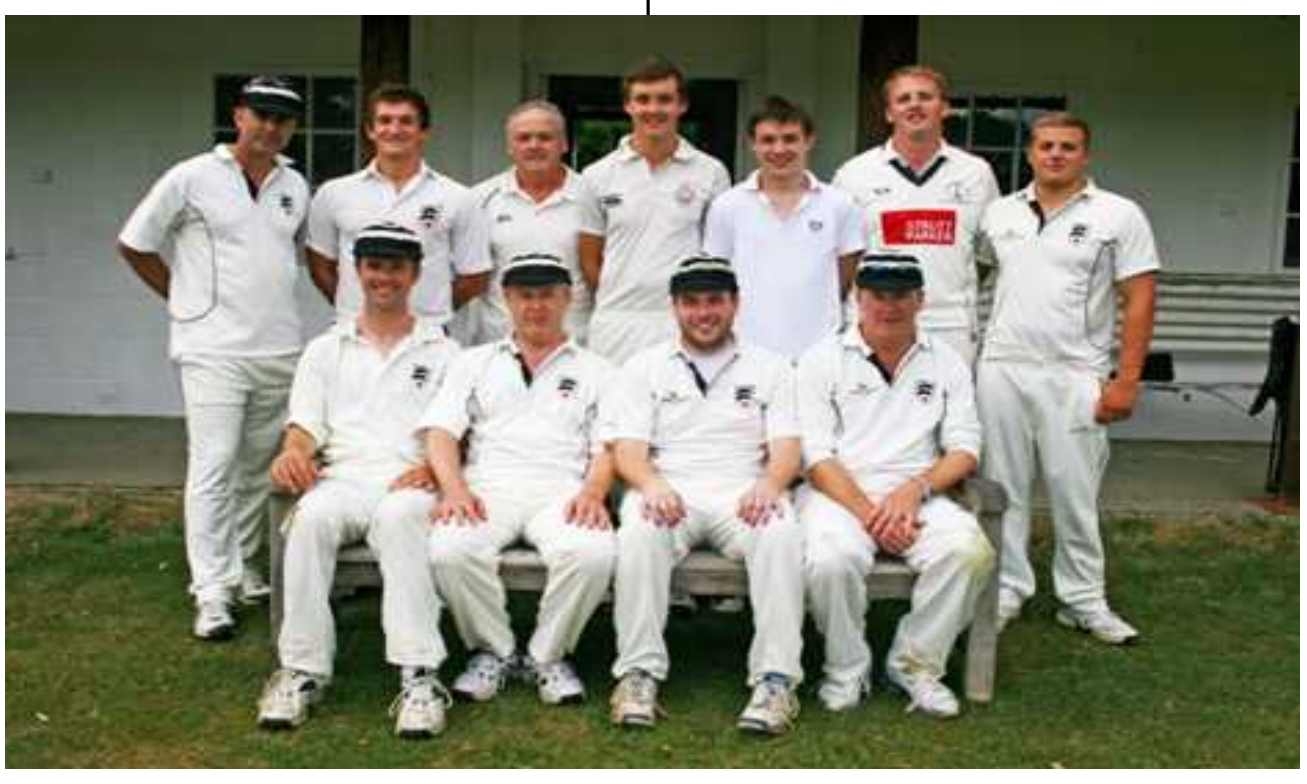
Bucklebury Cricket Club