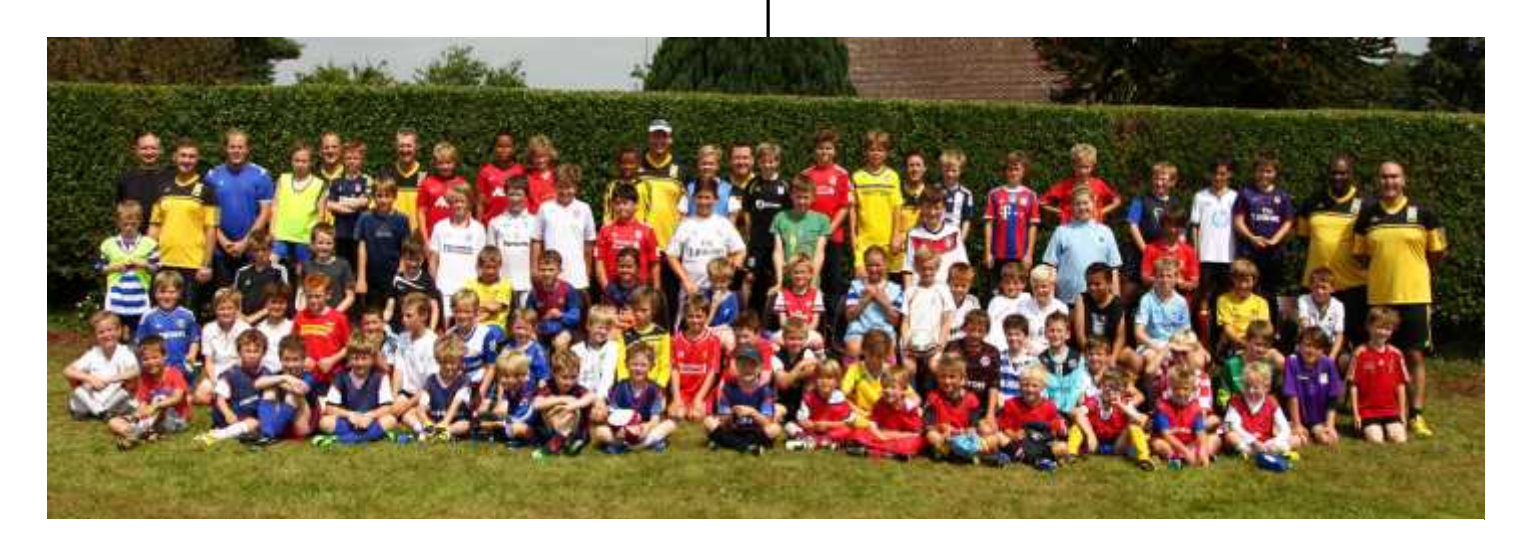
The Club photo shows most of the players and coaches who attended the annual World Cup last July 201.

Bucklebury Wolves Free Junior Football Club is a good example of good people working together for good outcomes to benefit children. We can all be proud of that at a local level.