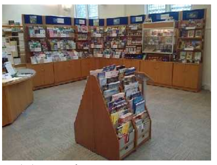
Inside the Visitor Information Centre.

Everyone who visits gets a free town centre map and self guided walk so they can find out more about Newbury and the surrounding area and we recommend places to eat, stay and things to do. Over 60% of our customers are local West Berkshire residents and to give you an idea of the number of customers we help every year, you could fill the O2 arena and more!