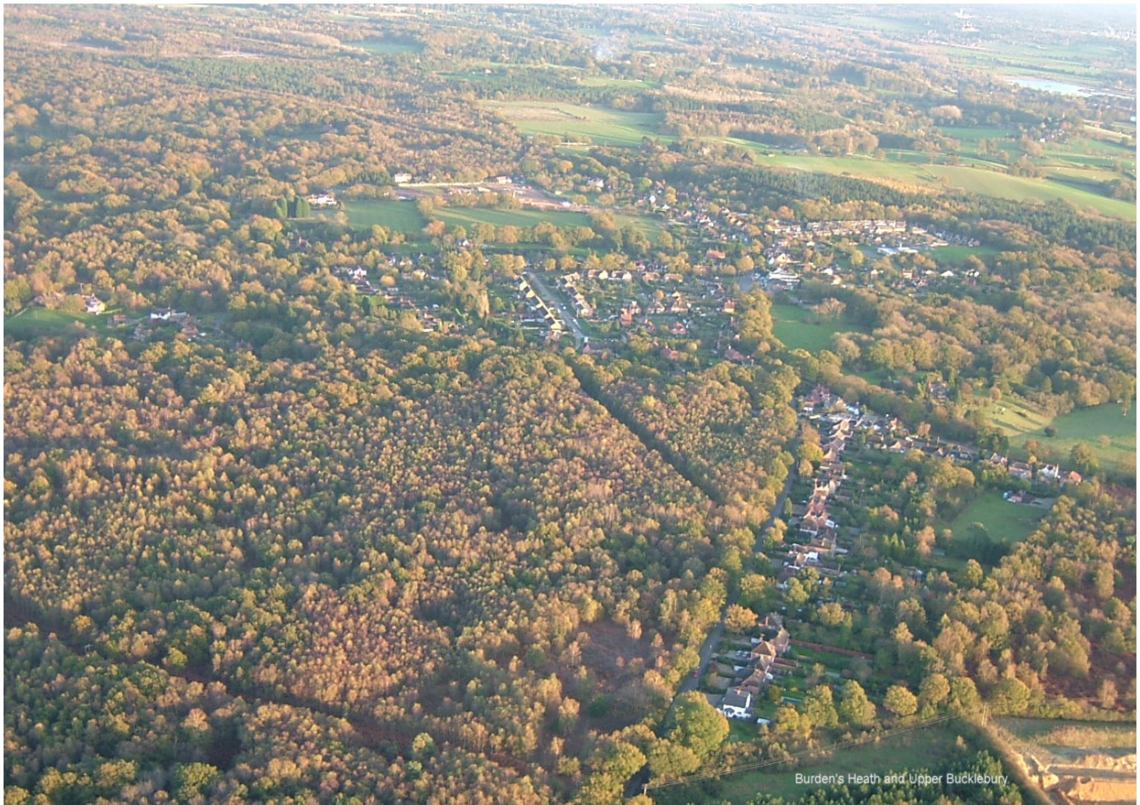
Burden's Heath and Upper Bucklebury