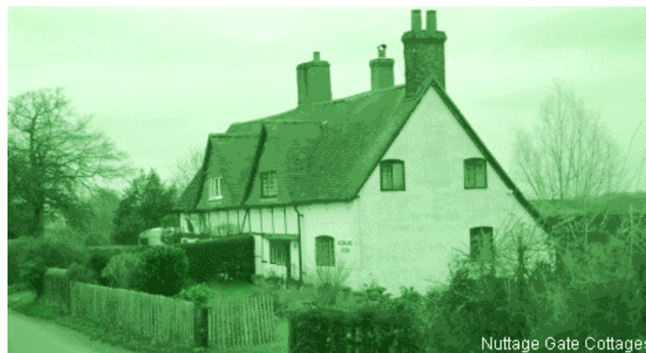
Nuttage Gate Cottages

‘Bucklebury Vision’ laid down the foundation standards for house design on quality, character, style and space, set out to complement the rural setting in the AONB. Extending the criteria to establish plans for the future, there is a strong desire to limit expansion. Any new housing, or extensions to present housing, must reflect the scale of established densities and remain compatible with the AONB status.