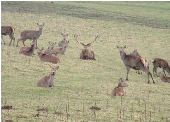
Bucklebury Farm Park