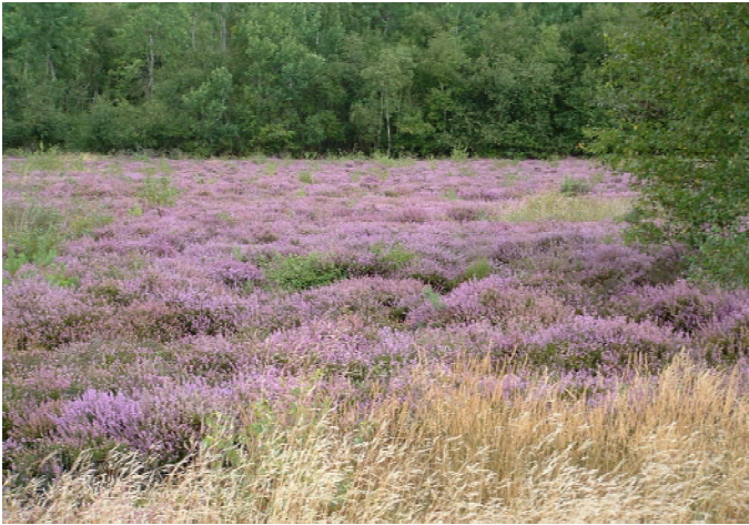
Heathland - Lower Common