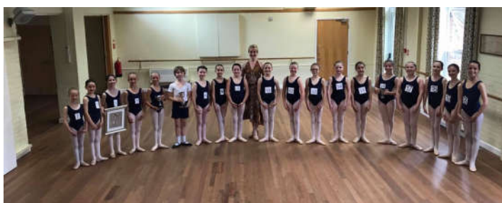
Cup Class - Junior Section