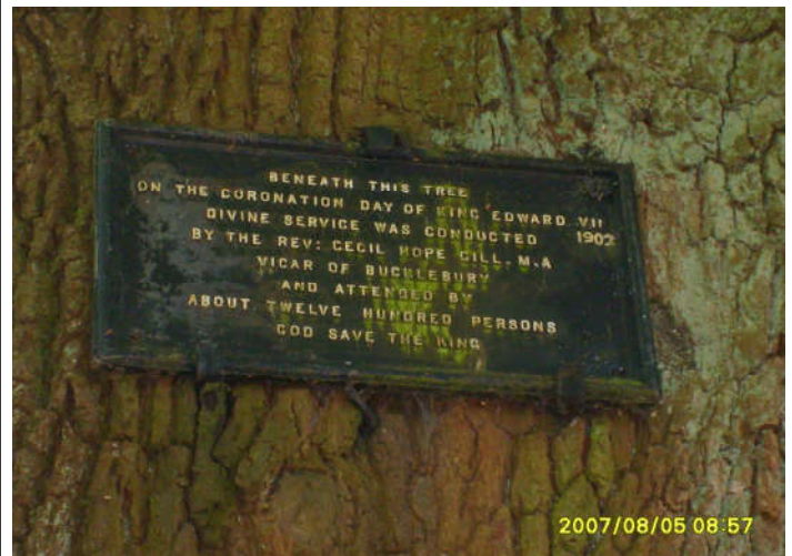
The plaque on the Coronation Oak

In 1902 the village prepared to celebrate the coronation of King Edward VII. Postponed by the illness of the King, it