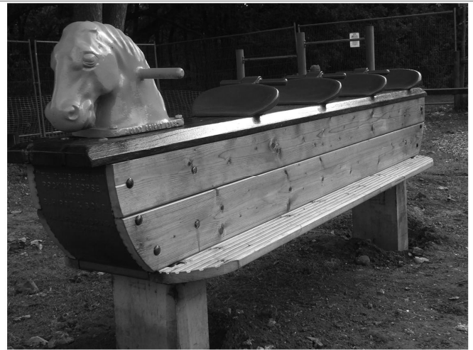
The horse in October 2009.