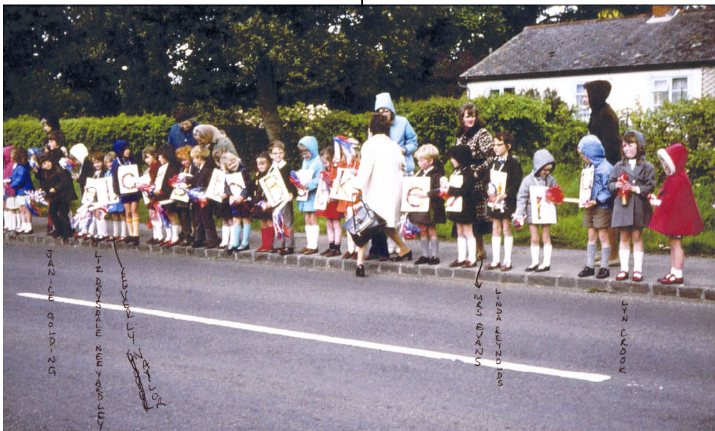
The Queen's Visit to Bucklebury