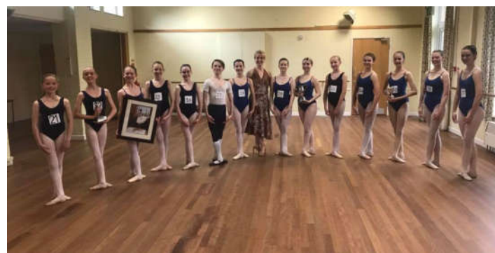
Cup Class - Junior Section