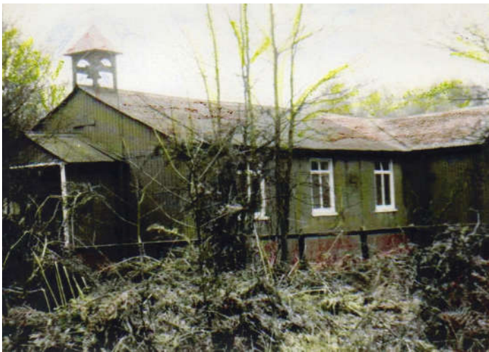
St. Saviour's Church (known as the Iron Church)