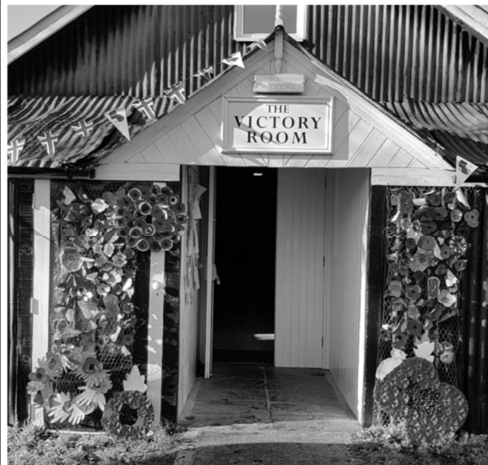
Poppies at the Victory Room