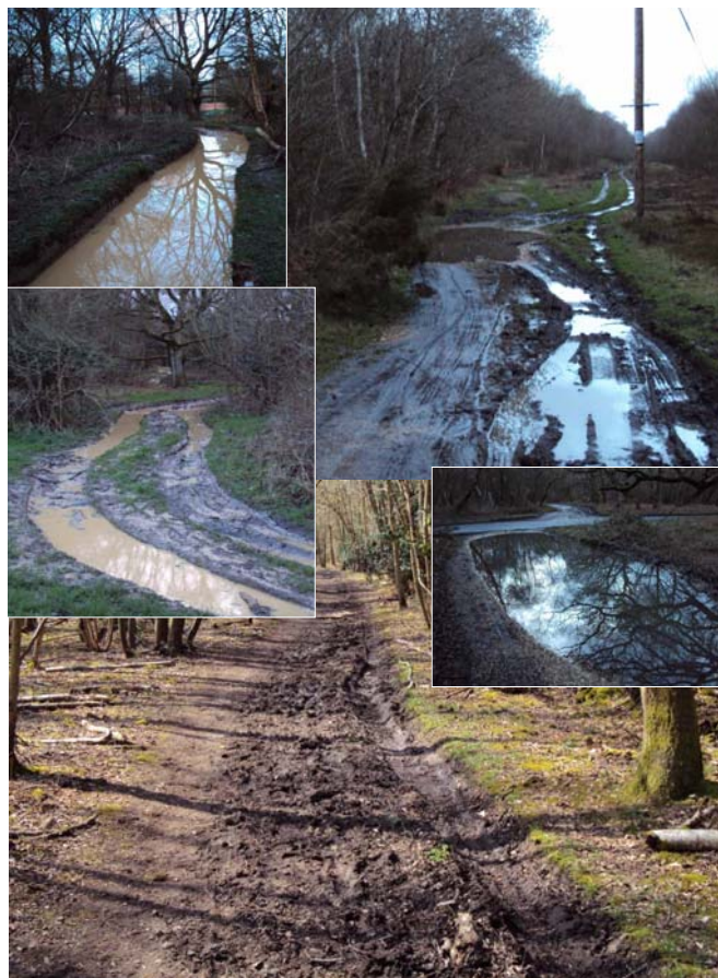
We are hoping to change this...

0118 9712768, johnlindyclarke@hotmail.com