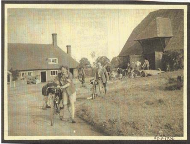
Bucklebury - Hillfoot Youth Hostel 1936

Middlesex. I had only started work the year before and was training in accountancy, but was asked to fill in on the early Saturday shift until 3.30 p.m. There had not been an air raid, doubtless due to the bad weather, so I had not had to rush over to the boiler house on receipt of "air raid warning red" to operate the wailing siren – just another of the little jobs I was expected to do.