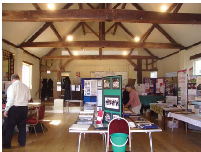
Getting ready for History Day