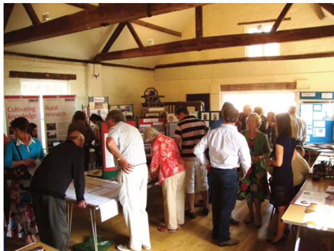
History Day - a very busy day!

life then please let us know. (However please don't call us if you find the bomb allegedly still on the common somewhere!) We learnt a lot, which will be followed up at a later date, including location of our defensive searchlights in Bucklebury during WWII. Watch this space!