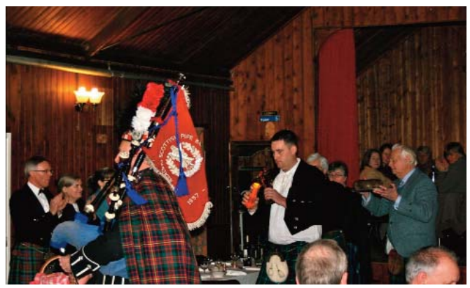
The Highland Ceilidh

This Scottish dance event was once again very popular - all tickets sold despite very cold weather - and as usual several requests for the same next year.