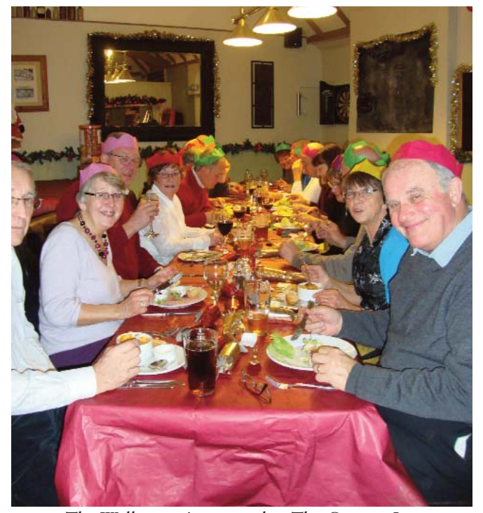
The Walkers enjoy a meal at The Cottage Inn