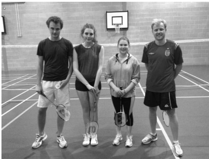
Bucklebury Badminton Club winners and runners up