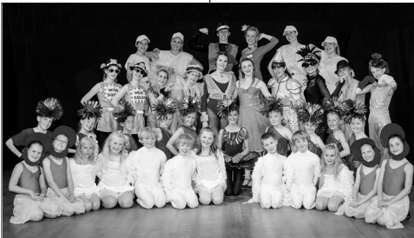
Students from WBBS performed The Wiz to packed houses in July